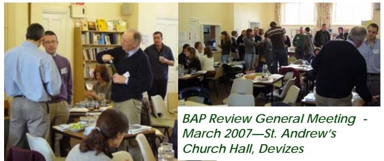
BAP Review General Meeting - March 2007—St. Andrew's Church Hall, Devizes

The review process began in March this year, with a General Meeting attended by over 50 representatives from the Partnership - from organisations ranging from Wessex Water, to the RSPB.