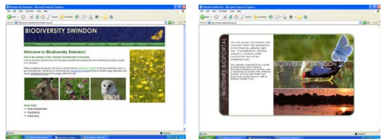
Left: Biodiversity Swindon, Right: Wiltshire Biportal

The Wiltshire BAP website is still under construction, but will soon be live at www.biodiversitywiltshire.org.uk . The Swindon BAP website has now been published - go to www.biodiversityswindon.org.uk to see it for yourself. Also don't forget the new portal to biodiversity and biodiversity action planning in Wiltshire at www.biportal.org.uk